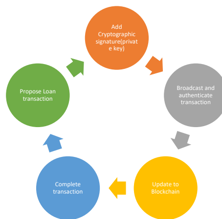
Figure 3: User management process.

The public key is used to create account addresses similar to bank identities or like account numbers in traditional banking. The private key will be required when signing transactions originating from the account (Figure 3). Each node on the network can verify its signature (Dingman et al., 2019; Zhong, Wu, Xie, Guan, & Qin, 2019).