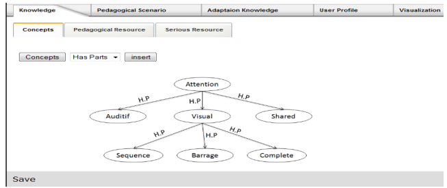
Figure 3: Knowledge editor screen

We've identified three kinds of knowledge that is represented by our system. They are: 1) domain knowledge, 2) pedagogical resource, and 3) serious game resources. The figure 3 shows the interface for creating the domain's knowledge.