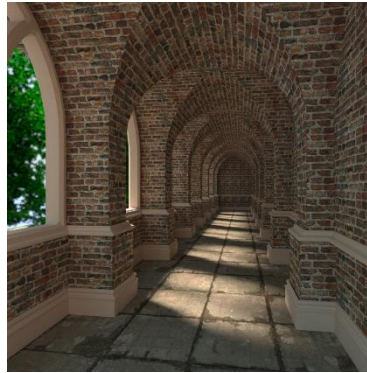
Rich 3D scenes