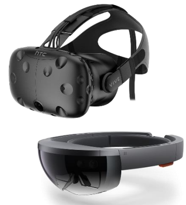
Virtual reality devices

The way of consuming and visualizing this 3D content is now evolving from standard screens to Virtual and Mixed Reality (VR/MR). However, the visualization and interaction with 6 degrees of freedom with large and complex 3D scene remains an unresolved issue in such immersive environments, especially when the scene is stored on a remote server. Two distinct bottlenecks exist: (1) the potential complexity of a 3D scene that can be displayed to the user on a VR/MR head-mounted display is substantially smaller than for a standard screen, because the GPU must generate 4 times more images (to ensure two images per frame and a sufficient frame-rate to prevent motion sickness); (2) since an increasing number of VR/MR applications consider 3D data stored on remote servers, strong latency problems may be encountered, caused by the streaming of the scene on the display device.