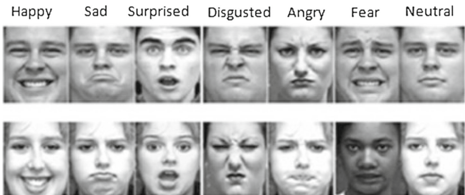
Fig. 2 Examples of six facial expressions of the Cohn-Kanade facial expression database